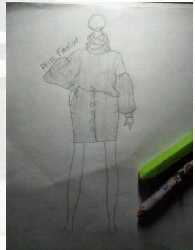
Some of my fashion illustrations